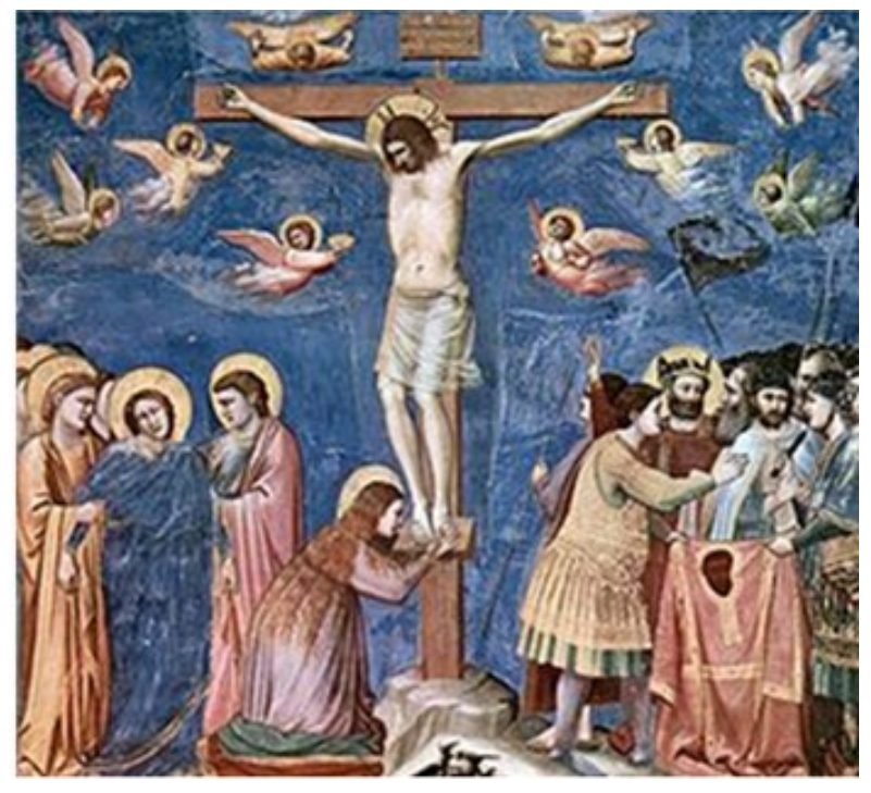
The Crucifixion - Giotto, c.1310