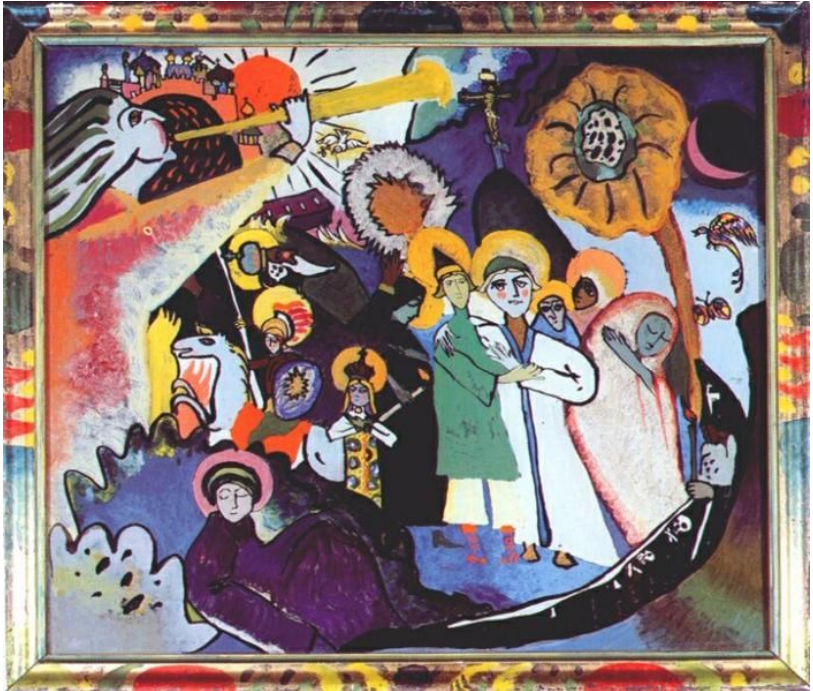
All Saints Day I, Wassily Kandinsky c1911