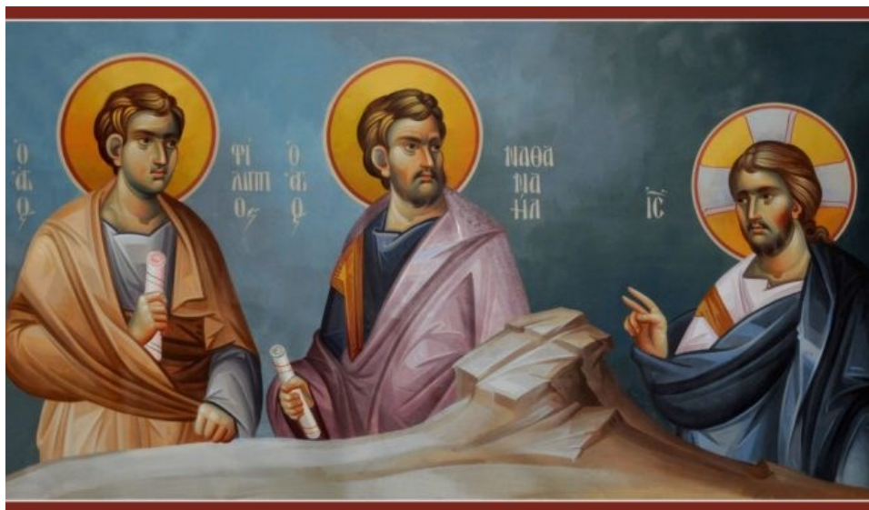
Jesus Calls Philip and Nathanael