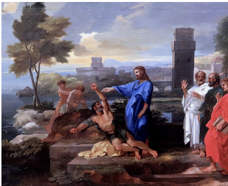
The healing of the demonic, Sébastien Bourdon, 1616-1671