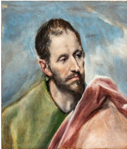
Saint Bartholomew the Apostle (fragment) - El Greco