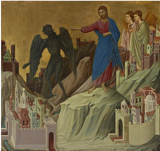
The Temptation on the Mount, Duccio di Buoninsegna 1308-11