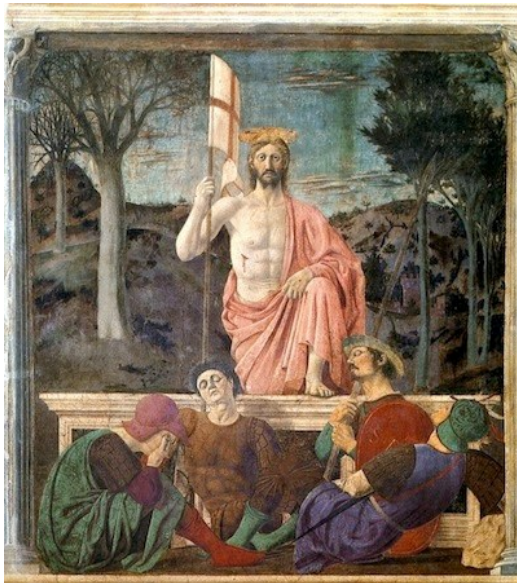
The Resurrection of Christ

Piero della Francesca, 1460s. Museo Civico, Sansepolcro, Umbria