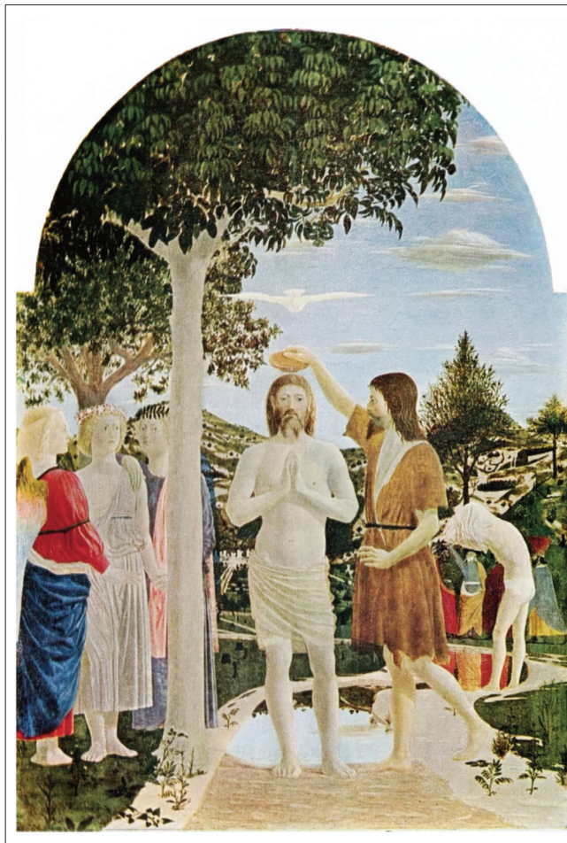
Piero della Francesca, The Baptism of Christ. 1450. National Gallery, London.

Mark is mentioned by Papias the Elder as having written his gospel accurately, by memory. Also, by Clement of Alexandria (15 – 205) and Eusebius (260 – 340).