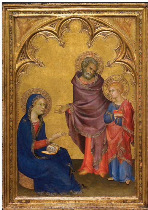
Christ discovered in the Temple, Simone Martini 1342 Liverpool Walker Art Gallery Tempera on panel Presented by the Liverpool Royal Institution 1948

To go to this exhibition is to go time travelling and see one of the most glittering times in art. Seeing the Passion and Resurrection unfold through the eyes of these artists during Lent and Easter makes it even more compelling.