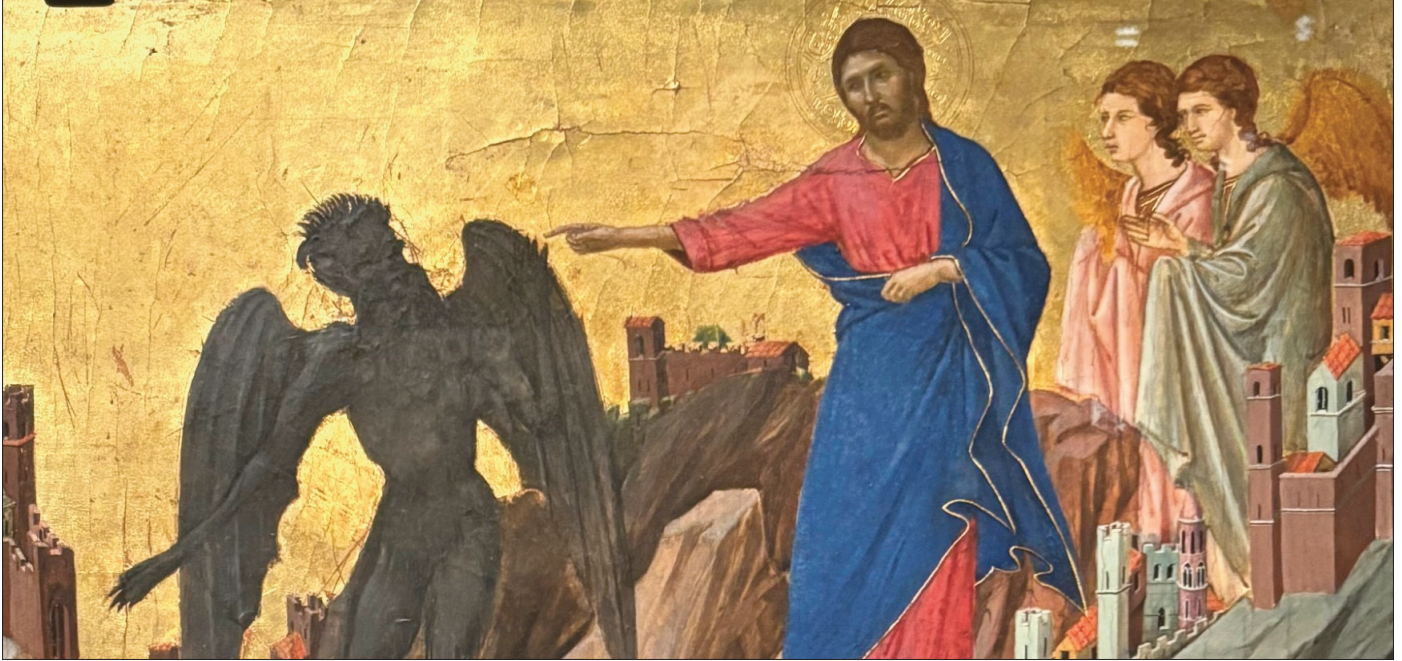
Duccio's Temptation of Christ (National Gallery of Art, Washington - currently in the National Gallery's Siena exhibition)