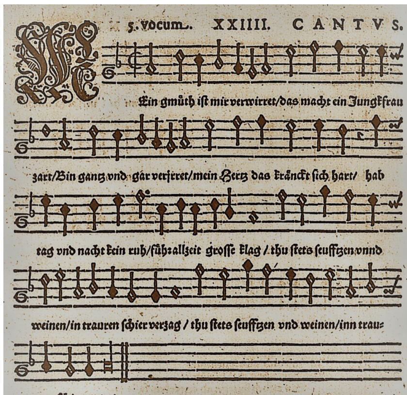
The tune of Hymn 90, in its original version as a Renaissance German love song